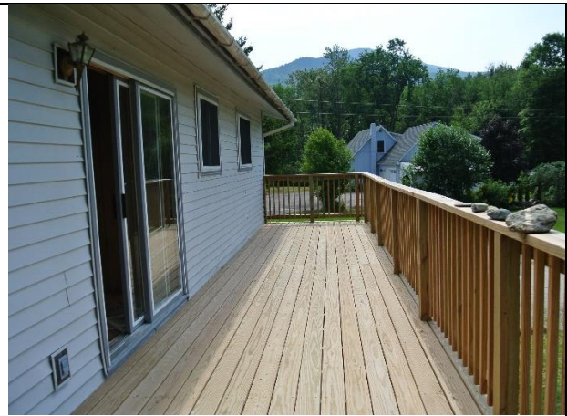
New Rear Deck