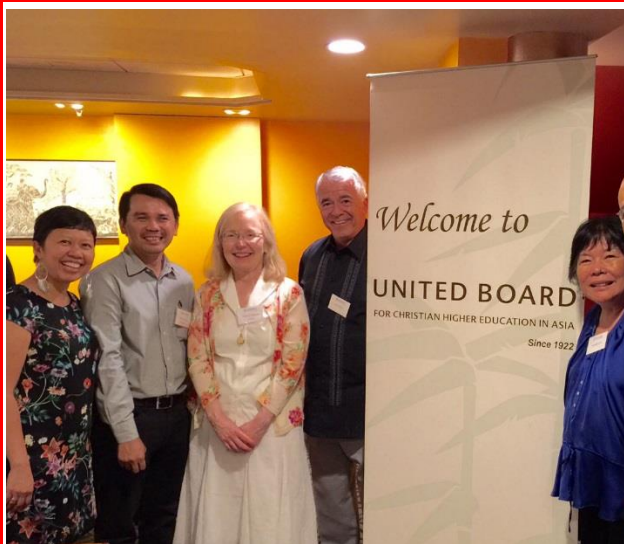
United Board Meeting July 2016